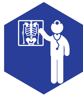
Clinical Support Management