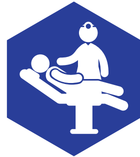
Support Services Management