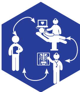
Supply Chain Management