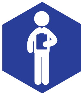
Back Office Management